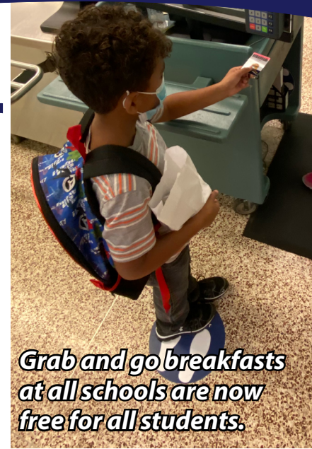
Grab and go breakfasts at all schools are now free for all students.