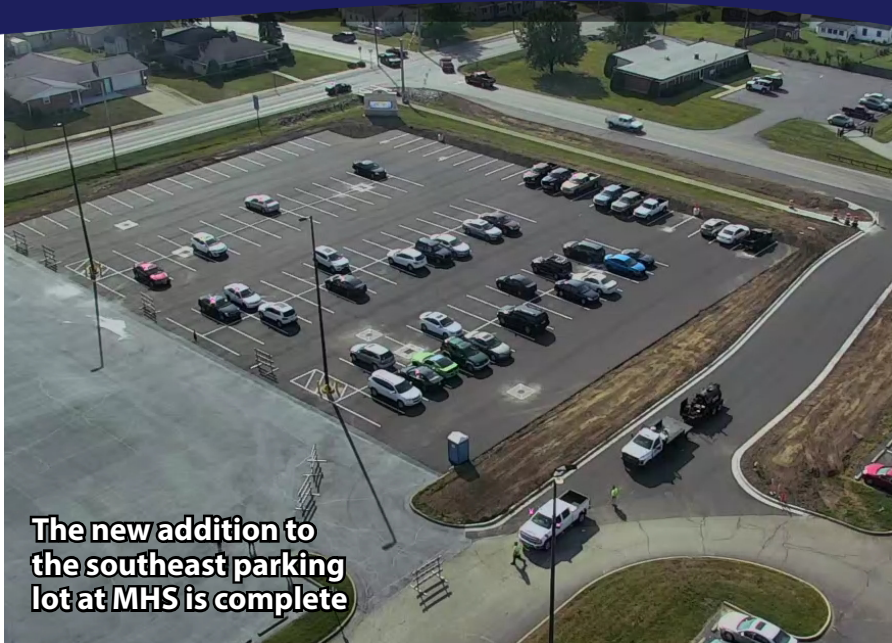
The new addition to the southeast parking lot at MHS is complete

The yet-to-be-completed parking lot east of MHS will serve as a new parent pickup and dropoff zone, providing a much needed area for traffic to line up off of Indiana Street. The lot will also serve as an area for staff and visitor parking for the high school as well as Northwood.