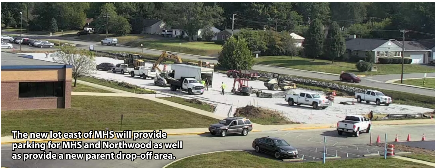
The new lot east of MHS will provide parking for MHS and Northwood as well as provide a new parent drop-off area.

MHS students should visit the school office to get their parking permits. Seniors will be able to paint their "senior parking spots" after the new east parking lot is completed.